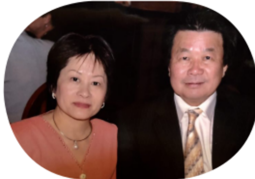
慈善大使-雷華欽伉儷。 駐美中華總會館前總董。 環球高級建材公司總裁。